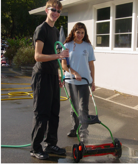
For a donation, they'll wash more than cars