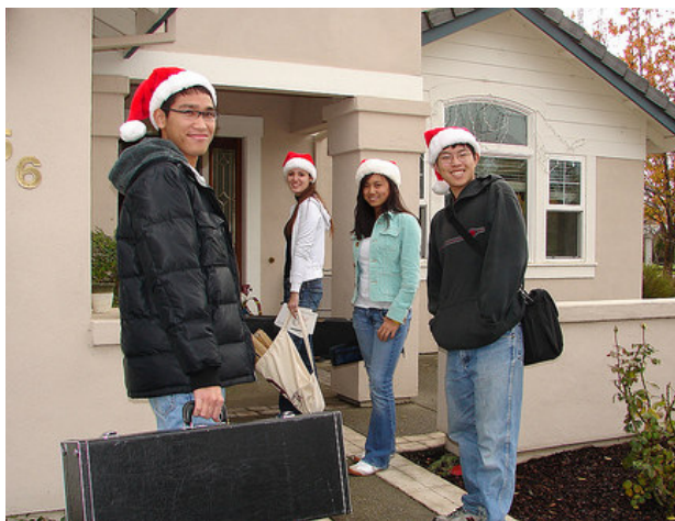
Rent-a-Band members arriving for a home performance, raising holiday spirits and trip funds.