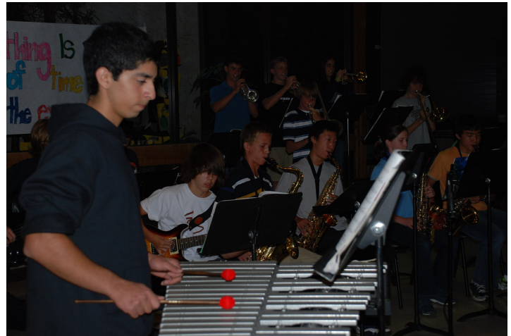
The Emerson Jazz Band entertains the crowd at Back to School Night.