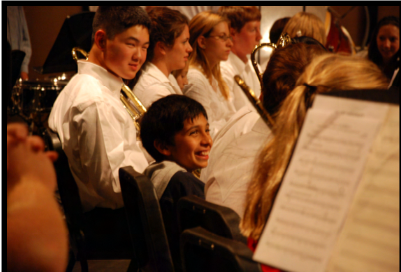
October Outreach Concerts brought DHS and 6th grade musicians together for a preview of the high school band experience.

Supporting the Davis High School Concert, Symphonic, Jazz and Pep Bands