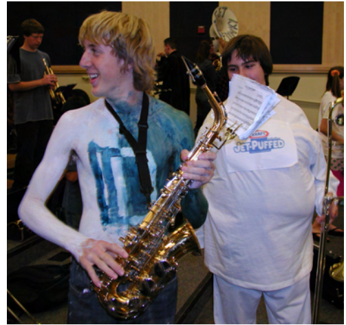
Pep band members prepare for the last football game in school colors and as a giant marshmallow.