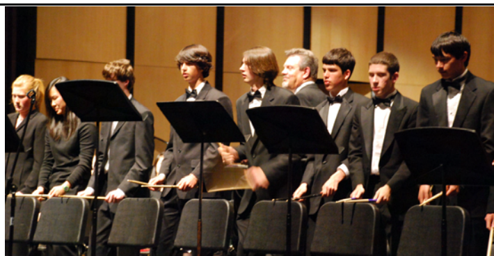
A DRUM LINE: A greatly expanded percussion section plays unconventional instruments for a rousing Riverdance number at the Secondary Concert on April 22.

Supporting the Davis High School Concert, Symphonic, Jazz and Pep Bands