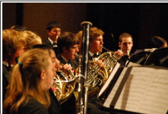
The Senior Concert from 2008 honored the seniors of the bands with red carnations.

In the past 2 months you were able to hear some great performances by our band students. These weren't just run-of-the-mill high school band concerts, these were great evenings of entertainment. I hope you were able to hear the Symphonic Band in the annual "Festivity Of Bands" in February. Here I think you were able to compare our work with that of the local colleges... bands which are comprised of students majoring in Music. I am pleased to say that our Symphonic Band was certainly on a par with both of these groups (if not even better than them).