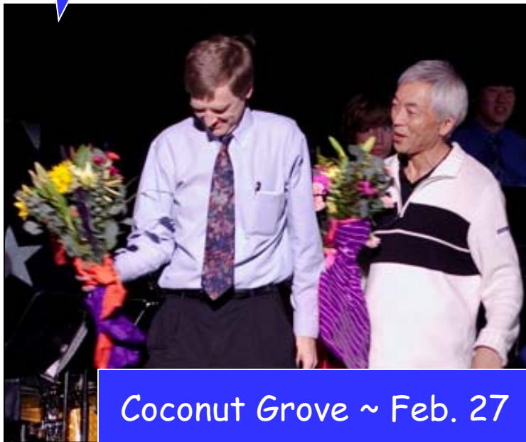
Coconut Grove ~ Feb. 27