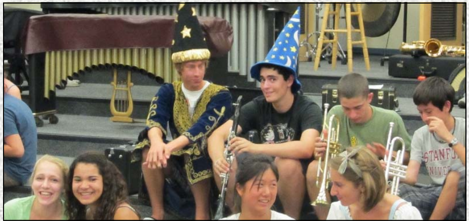
PEP BAND at Football ~ Sept. 2011 ~