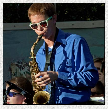
JAZZ BAND @ Davis Jazz & Beat Festival Oct. 22, 2011