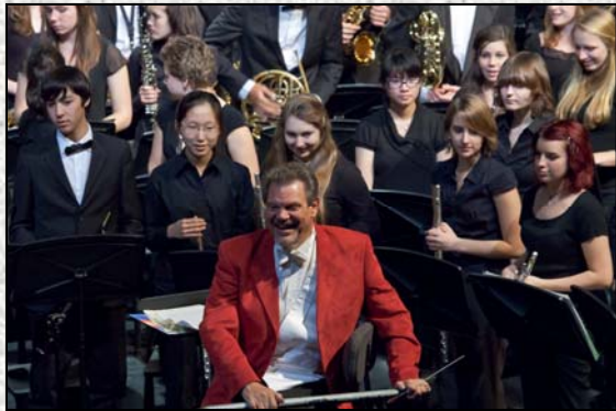
Winter Rhapsody December 15, 2011