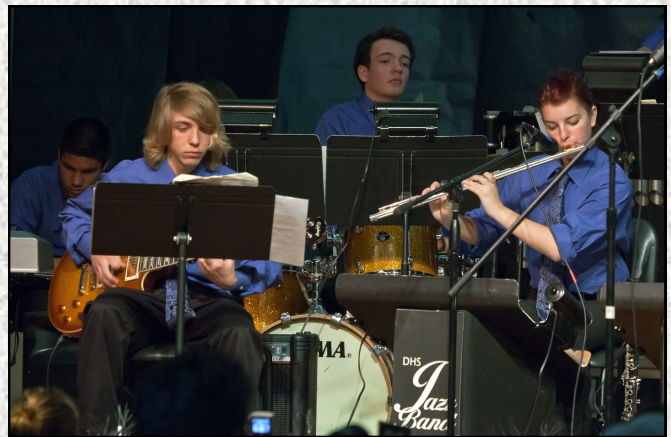
Coconut Grove March 10, 2012