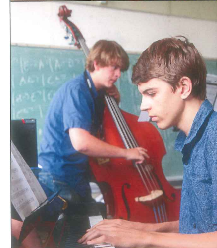
All images courtesy of Jim Levitt