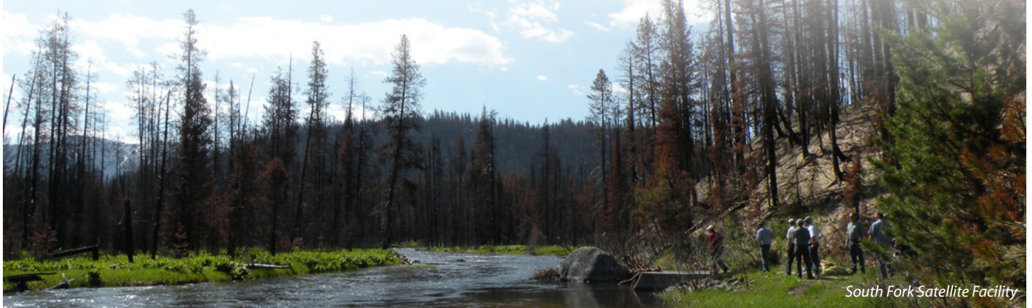
South Fork-Satellite Facility