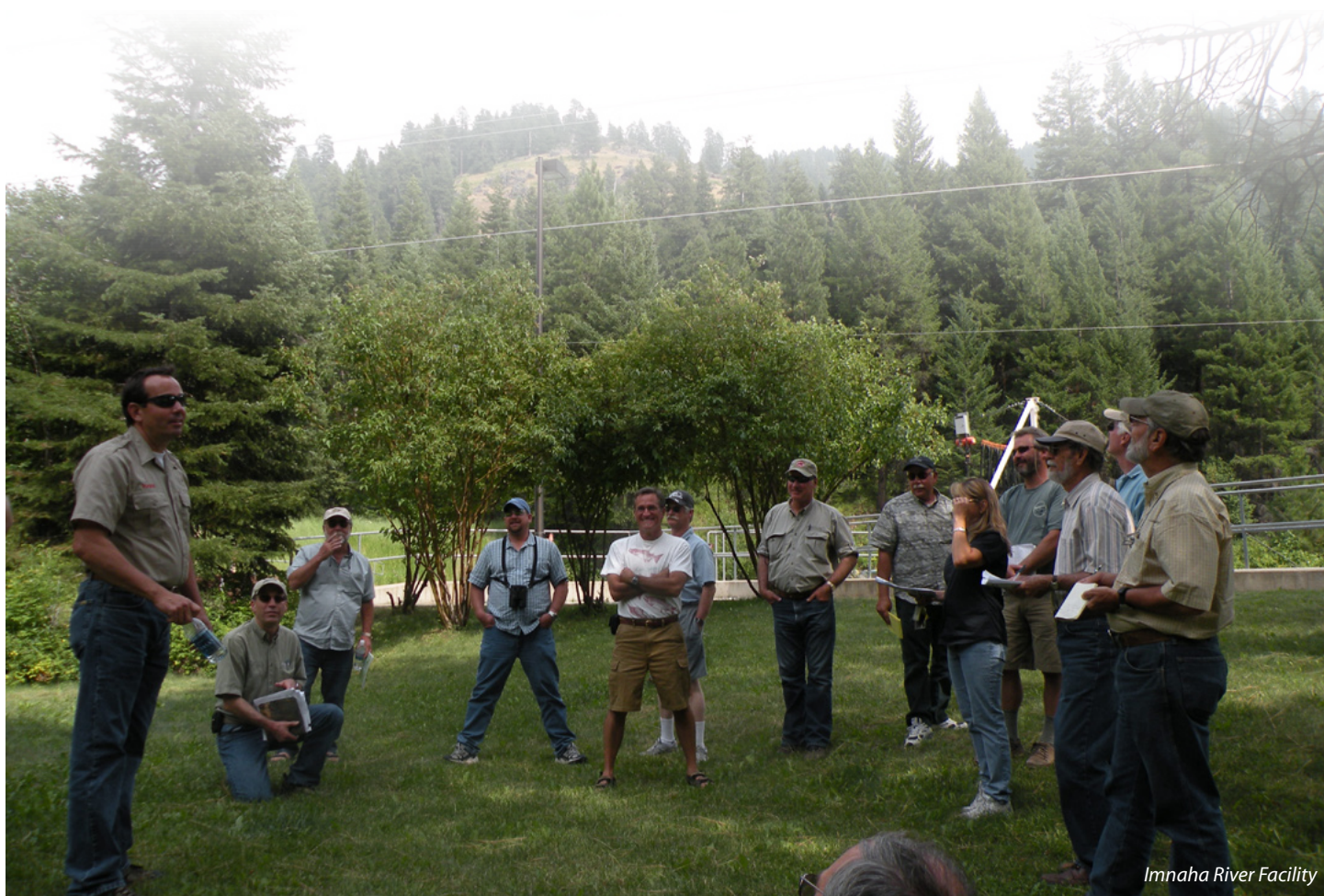
Imnaha River Facility