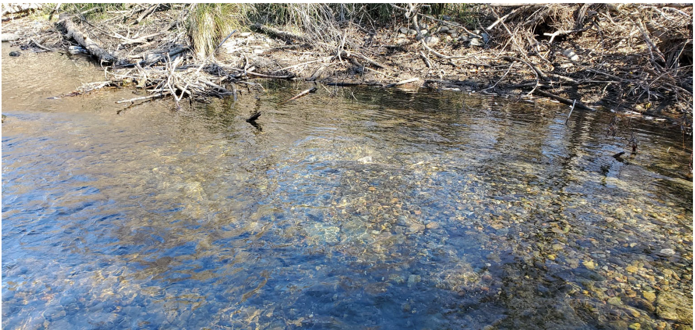
Photo of the week: A Chinook Salmon (look for the light-colored triangle-shaped dorsal fin near the center of the photo) constructs a redd in the Trinity River.

For more information regarding mainstem Trinity River redd surveys, please contact Steve Gough (707-825-5197; steve_gough@fws.gov ).