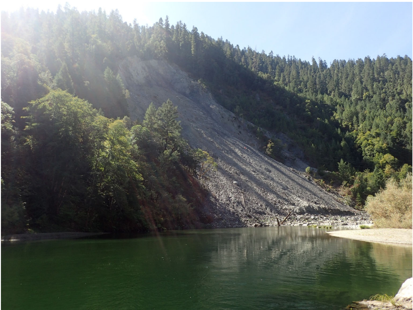
Photo of the week: Still relatively new, this slide near Salyer, California occurred just last winter.