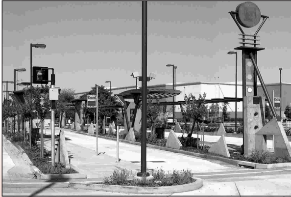
Sample Transit Center, Union City, CA